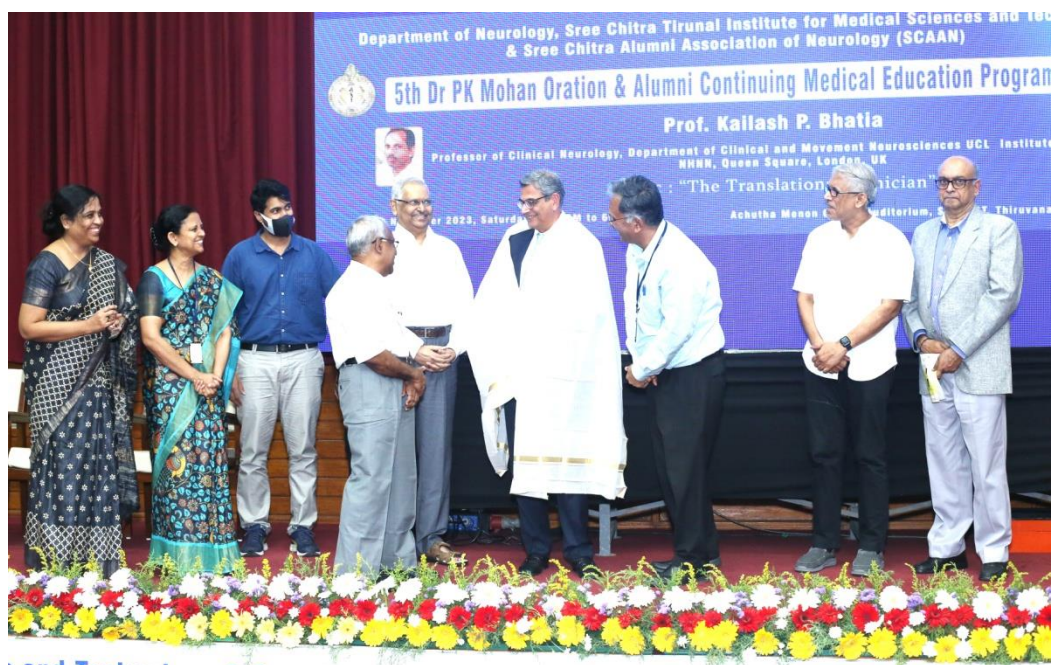
and Technology & Sree Chitra Alumni Association of Neurology (SCAAN)